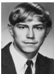
Larry Kraud PO Box 56 Onarya IL 60955