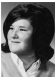
Kay Bennett - LOST